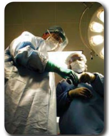
Cabell Huntington Hospital completes two-tier storage system with Plasmon UDO Archive Appliance for medical image archiving.

With more than 150,000 exams performed per year requiring approximately 3.5 TB of annual storage and an expected 15% to 20% increase in the number of exams performed per year, CHH needed a long-term archival solution with easier access, safer retention and adherence to compliance policies.